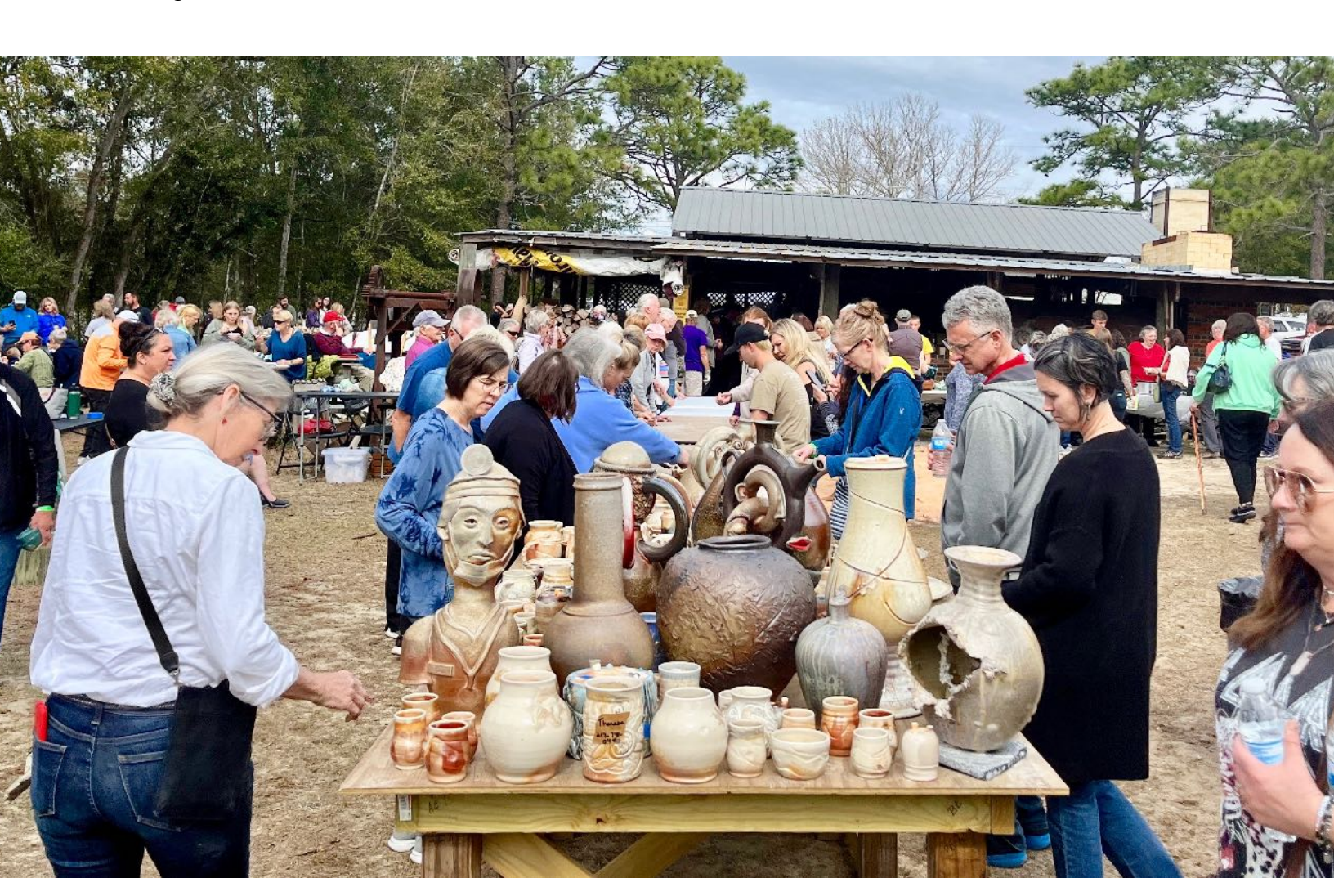
Thank you to everyone for making the WoodStoke Festival so much fun!