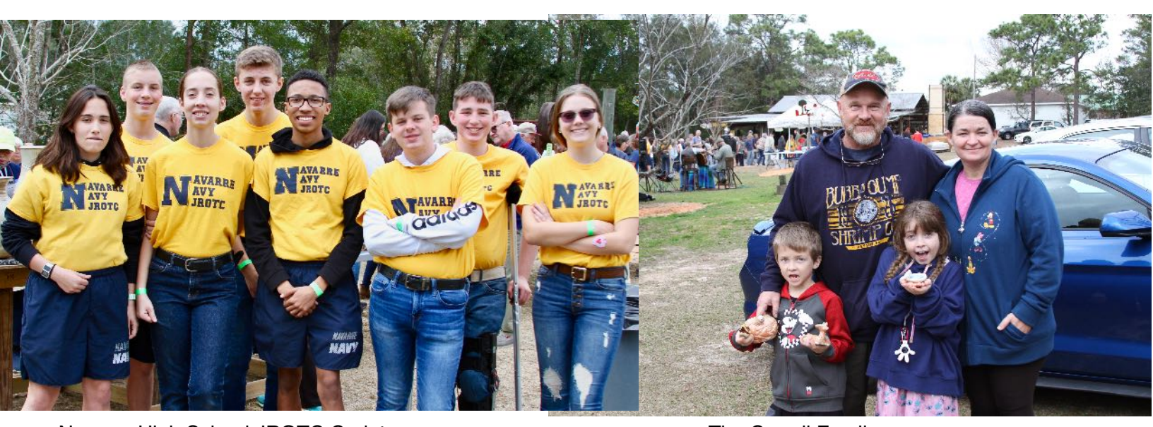
Navarre High School JROTC Cadets